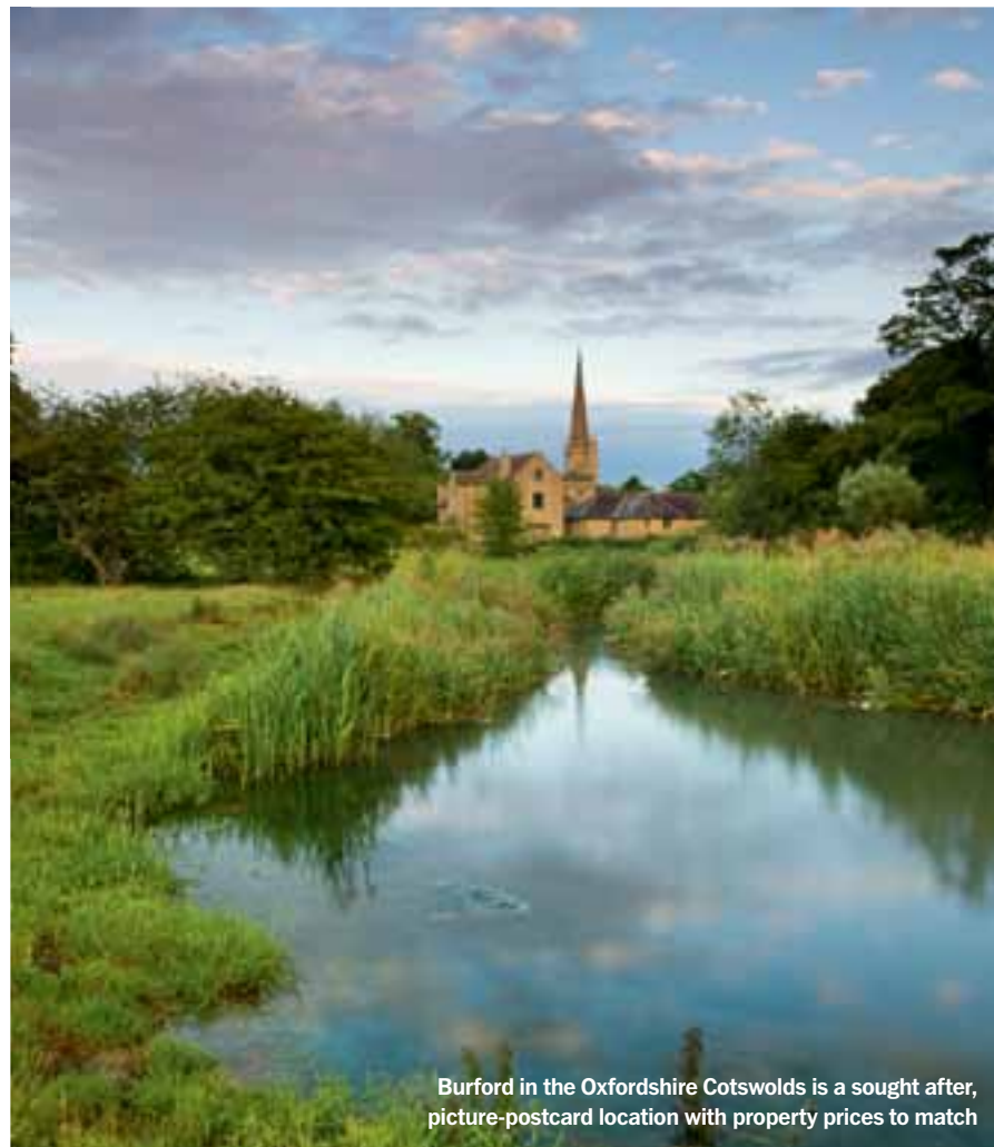
Burford in the Oxfordshire Cotswolds is a sought after, picture-postcard location with property prices to match