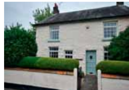
Lavister, Wrexham Cottage, £300,000+ A three bedroomed cottage with a detached garage and good sized gardens. Features Georgian-style windows and quarry tile flooring. Estate agent: Town and Country, Chester