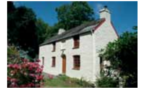
Lee Bay, near Ilfracombe, Devon Detached cottage, £350,000 A three-double bedroomed 19th-century cottage. Estate agent: John Smale & Co, Barnstaple