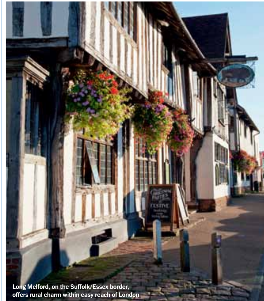
Long Melford, on the Suffolk/Essex border, offers rural charm within easy reach of London