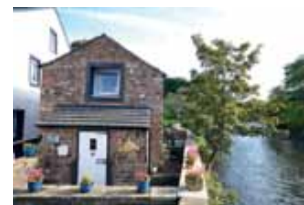
Egremont, Cumbria Mill cottage, £159,950 This 12th-century detached former watermill has two bedrooms. A rear garden includes a patio area, two storage sheds and a summer house. Estate agent: Lillingtons, Whitehaven

The Lake District is one of those places that swoons over you as soon as you arrive. Ever popular with holidaymakers and escapees alike, it nonetheless manages to maintain an atmosphere that is both businesslike and relaxing. Prices within the Lake District National Park itself are higher than outside for obvious reasons, but there are good alternatives a short drive away, for example around Egremont and Cockermouth. The only real hurdle with a move to the Lakes is distance. From London it's a good five to six hour hack. So if you fancy a similar feel, with mountains, lakes, and accessibility, Powys in Wales is only three hours away from London and half that from Birmingham. It's home to the Brecon Beacons, and as Wales's largest county, it runs right up to Snowdonia. Prices are attractive, and for anyone wanting lots of property with land and outbuildings, yet within striking distance of the rest of the central belt and the capital, it is certainly worth considering. Brecon itself, Crickhowell, Builth Wells and Rhayader would be my starting points.