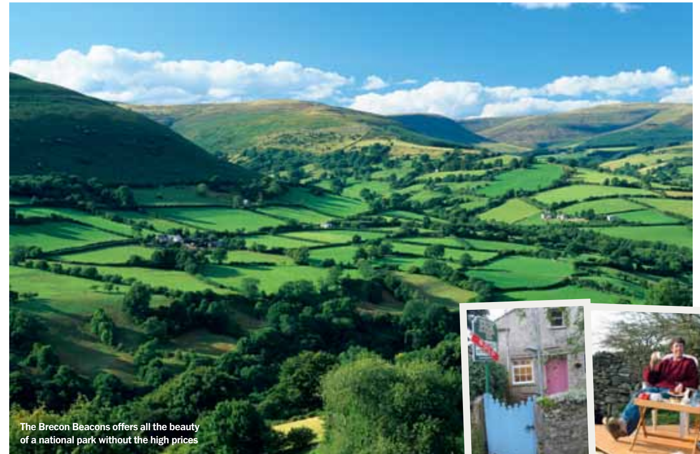
The Brecon Beacons offers all the beauty of a national park without the high prices