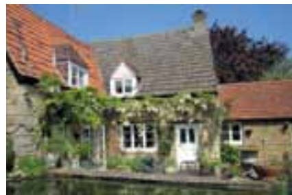
Stanion, Northamptonshire Detached cottage, £249,950 This Grade-II listed, two/three bedroom cottage offers original features, such as an inglenook fireplace, exposed stonework and beams. Estate agent: Simpson West, Corby

The Cotswolds are perhaps the destination of choice for many, particularly if you live in or around central England. Hugely popular with weekenders and locals alike, the region's seemingly endless picture-postcard villages such as Burford, Bourton-on-the-Water and Broadway, built of warm, golden limestone, have defined country life for many who now eulogise the area. But it is expensive, and you may feel like you are living in a goldfish bowl when besieged with tourists. For a good alternative that's more affordable, check out Northamptonshire; it too is blessed with an historic supply of limestone and a gentle landscape to match. Higham Ferrers, Irthlingborough and Oundle are good starting points.