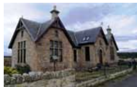
Dalcross, Inverness, Highland Newton Hall, £335,000 A four-bedroomed, detached converted school. Estate agent: CKD Galbraith, Inverness

The Scottish Highlands provide the most dramatic backdrop to any home; the scale of the landscapes that stretch northward from Glasgow and north and west from Inverness have to be seen to be believed. If you feel that remote isolation is for you, this is where you want to look, yet should you need to you could still find yourself within an hour of both Inverness and Glasgow airports. If you do decide to house hunt here, allow plenty of time: getting around the Highlands in a hurry is not an option. You'll enjoy a slower pace of life here, whether you want to or not. My favourite spots are up on the coast near Fort William; Glen Coe and Ben Nevis are just breathtaking, and tiny villages that pop up around Loch Ness will leave you feeling as far away from the hustle and bustle as is possible. What's more there is a happy irony to the property market up here; while most of us value the remote beauty of it all, it does make things a lot cheaper.