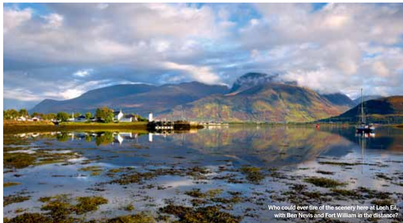
Who could ever tire of the scenery here at Loch Eil, with Ben Nevis and Fort William in the distance?