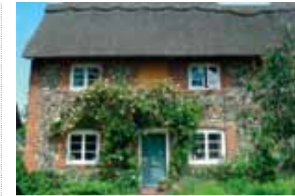
Hengrave, Bury St Edmunds, Suffolk Semi-detached thatched house, £289,950 This 18th-century Grade-II listed property has three bedrooms and a series of sizable gardens. Estate agent: Sheridans, Bury St Edmunds