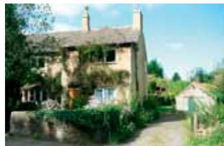
Easton-on-the-Hill, Lincolnshire Semi-detached cottage, £249,995 A two double-bedroomed property with a lawned garden, outbuildings, and a large garage. Estate agent: Knight Partnership, Stamford

Lincolnshire is a part of the country often overlooked. To many it's characterised by the flat lands of the fens. While the reclaimed fenland makes an invaluable contribution to the nation's agriculture, few would call it beautiful; the process of reclamation has meant that much of it doesn't really have a vernacular style of any great form or history. But don't give up on Lincolnshire. Lincoln itself is a vibrant treat, and its upland Wolds are just beautiful, as are the villages around Stamford (above) and Grantham. If you arrived with a blindfold on, you'd be forgiven for thinking you were in the Cotswolds. What's more it's not far to London by train. Lincolnshire arguably offers commuters and locals alike some of the best value for money I have seen.