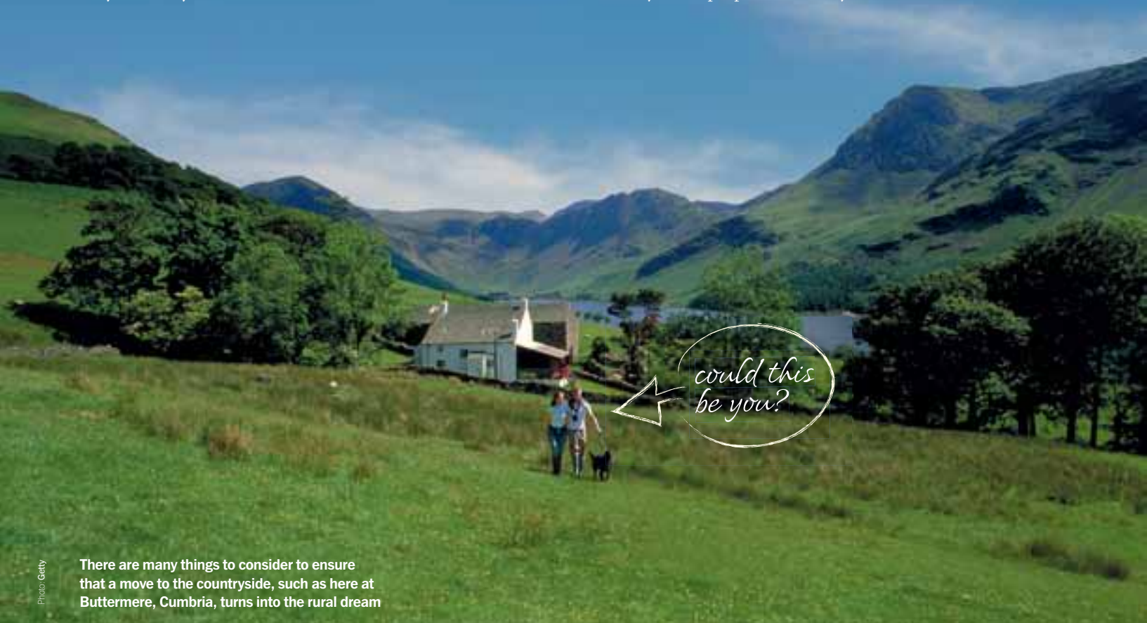
There are many things to consider to ensure that a move to the countryside, such as here at Buttermere, Cumbria, turns into the rural dream

Understanding these pointers can prove invaluable in setting out to find your ideal escape. Over the next few pages, we explore some of the things I have learnt and shared over many years, and that I hope will help you to turn your hopes and aspirations into reality. If you have been thinking about it, why not make 2013 your year of change? The countryside may not be as unfamiliar as you think. »