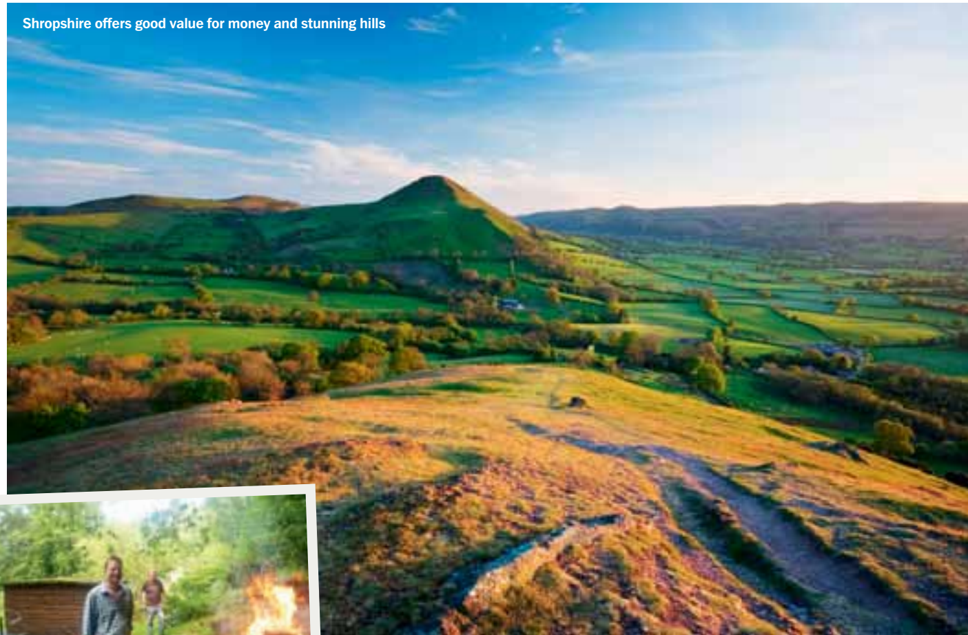
Shropshire offers good value for money and stunning hills