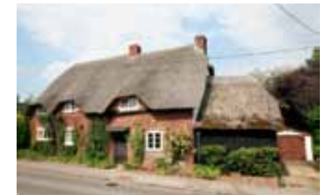
Shillingstone, Dorset Thatched cottage, £349,950 This Grade-II listed cottage has three bedrooms. Estate agent: Abbot and Slater, Blandford Forum