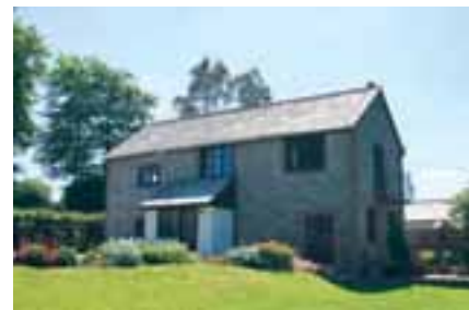
Pempwell, Stoke Climsland, Cornwall Detached barn conversion, £299,950 A three-bedroom property with spacious gardens. Estate agent: Mansbridge & Balment, Tavistock

Cornwall is one of the most aspirational places to escape to. Popular with many as a holiday retreat, the lure of the coast, the moors and its often-dramatic history of smuggling, shipwrecks, and mining have ensured that Cornwall has an enduring appeal. Prices on the coast are always going to include a premium that can be at odds with the realities of life in a place that is often seasonal. All well and good if you have the money and the living behind you, but if you have to leave the region regularly for work, it really is a long way from anywhere. So if coast and raw countryside is for you, but you need to be within four hours of London, try Pembrokeshire and Carmarthenshire. You'll get affordability with a choice, and some of Britain's best beaches and attractions, too.