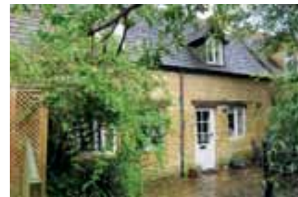
Chipping Campden, Gloucestershire Cottage, £300,000 This well presented three/four bedroom cottage, in the centre of the town, is currently used as a holiday let. Estate agent: Mark Annett & Co, Chipping Campden