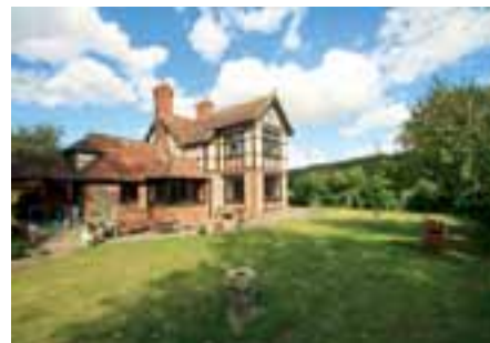
Longville, Much Wenlock, Shropshire Cottage, £349,950 This semi-detached three-bedroom cottage is set in beautiful countryside and has large gardens and ample parking. It also has a separate annexe. Estate agent: Stentons, Much Wenlock

The Welsh borders are a property hunter's delight. They offer wide ranging scenery, from the rich rolling hills of Monmouthshire and the mysterious magic of the 27,000-acre Forest of Dean, to the endless views afforded in Herefordshire. Neighbouring Shropshire is a hidden gem of a county, full of history and character, with some of the most fantastic rural properties on the market, offering particularly good value for money the more you spend. Further north and another border hop into Clywd and Denbighshire will also reveal some terrific landscape with property to match. For many who have not been as lucky as I have to travel extensively around the UK, the borders are often not even thought about. The south-west generally is the urban escapees default, but take it from someone who has travelled widely throughout the borders and now lives there; they are central, beautiful, affordable, and they are most definitely not over-crowded.