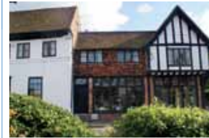
Old Oxted, Surrey Terraced cottage, £348,500 A two bedroomed property with an enclosed internal courtyard and notable period features. Estate agent: Howard Cundey, Oxted

London has always had an affect on the prices of rural properties that are within its shadow. Traditionally, Kent, Surrey and Sussex have all been favoured by those with deep pockets wishing to commute to the city. These days, it seems most transport links to these areas struggle to cope and are increasingly expensive, as are properties. Personally, if had to rely on London but wanted a rural retreat, I'd pick Suffolk or Norfolk. Here you can still find a genuinely slower pace of life with some fantastic architectural styles on offer, not least timber-framed historic gems. Rail links to London are good, but, if you have to drive, there are many alternative routes available. Bury St Edmunds is a good regional town that serves some beautiful villages, such as Long Melford and Lavenham.