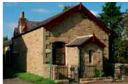
Lowgate, Hexham, Northumberland The Old Chapel, offers in region of £165,000 A detached, two-bedroom stone property. Features gas central heating and double glazing. Estate agent: Northumbria & Cumbria, Hexham

The north-east is an area I fell in love with more than 20 years ago. Since then, every visit has been a treat. As an archaeologist, I recall my first trip to Hadrian's Wall. This extraordinary feature of the landscape stretches out between two seas, cutting the country in half. The landscape either side of it is littered with pretty towns and villages, such as Hexham and Corbridge, which owe their origins to the Roman Legionaries that first ventured northward and then stopped to consolidate the edge of the Empire. The uplands are as dramatic as any in the Peak District or North Yorkshire, but you have the benefit of Newcastle with its bright lights and airport to hand, as well as the wild beauty of the coastline and Kielder Forest just a short drive away.