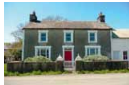
Caerfarchell, Solva, Pembrokeshire Former post office, £250,000 A four bedroom house, 2½ miles from the coast. Estate agent: JJ Morris, Fishguard