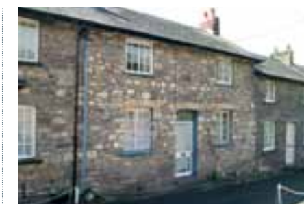
Crickhowell, Powys Terraced cottage, £219,950 This stone cottage has two bedrooms, alongside a reception room, which can be converted into a third bedroom, and a garden. Estate agent: Bidmead Cook, Abergavenny