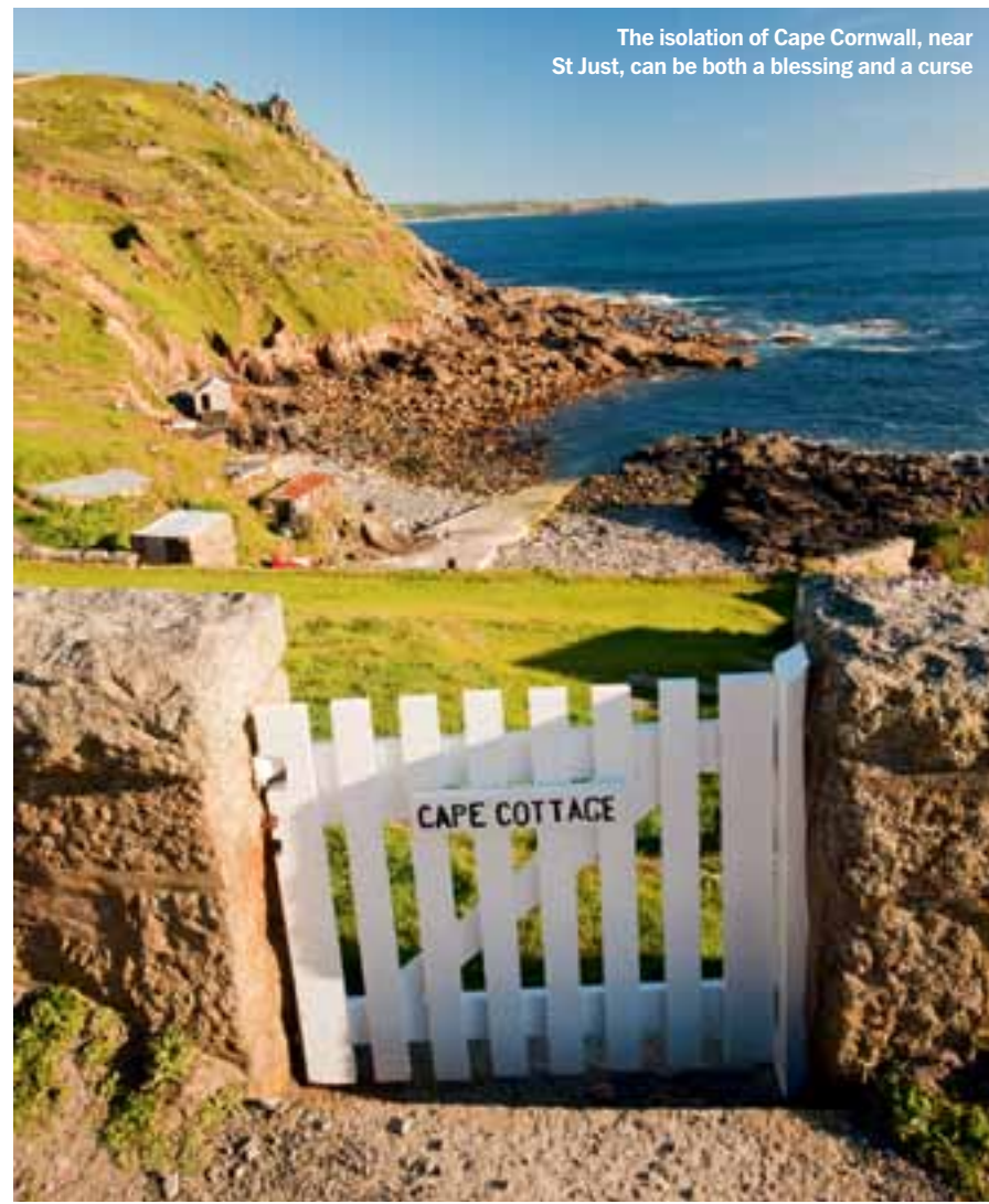
The isolation of Cape Cornwall, near St Just, can be both a blessing and a curse