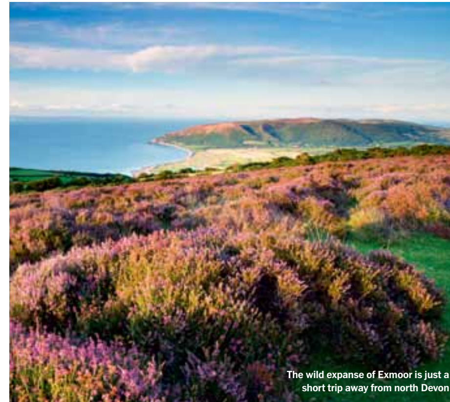
The wild expanse of Exmoor is just a short trip away from north Devon